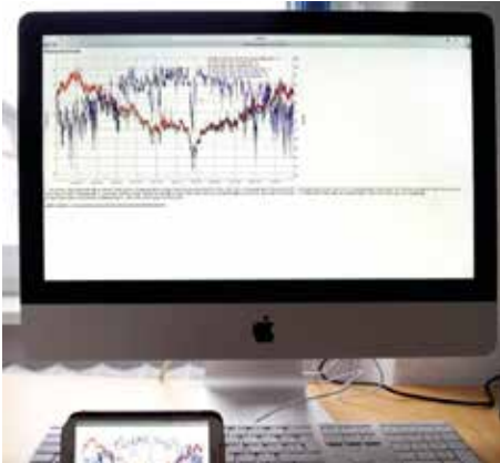
Figure 5: Read the climate data from the Schwahl, via Mobilephone and PC.

significantly reduce the amount of damage caused by temporarily unfavourable climate conditions.