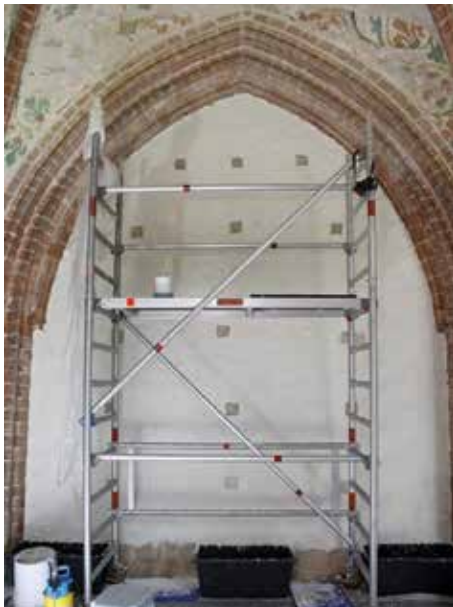
Figure 2: Application of desalination poultices

The Schwahl has been used as a walkway for processions and shows polychrome paintings on the arches of the 24 yokes. The paintings represent fabulous creatures and are largely well preserved. Moreover, the wall panels shown in the picture below are covered by paintings giving a chronological depiction of Christ's life cycle.