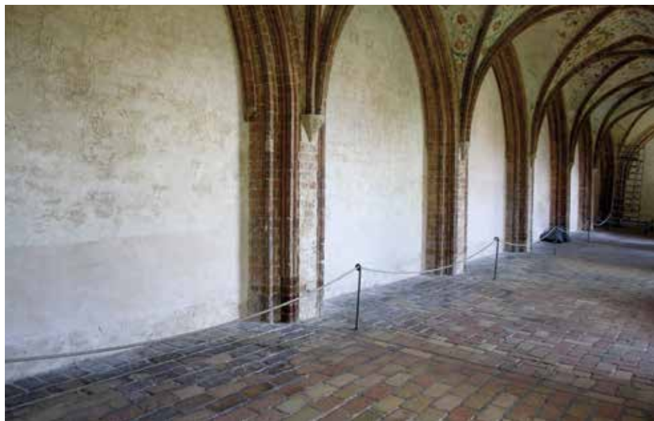
Figure 1: The Schwahl in Schleswig, exterior walls with the chronological depictions of Christ's life cycle

Measurement data are transferred directly to an open-source based server in-