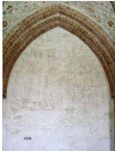
Figure 3: After the application of desalination poultices