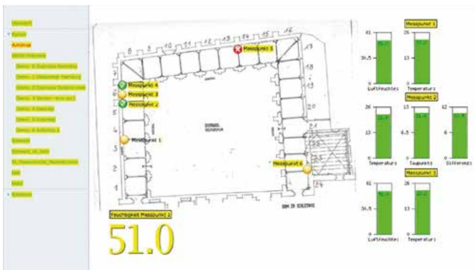
Figure 6: Visualization of the measuring points on site, defective devices are displayed in real time (measuring point 5).

The climate data are measured with set intervals by sensors distributed in the monument, collected in a local data hub and then transferred directly to a secured internet server. In addition to the commonly requested data on room temperature and relative humidity, sensors for outside climate, etc. can be easily integrated into the system. Via authorized access rights clients can access their data in real-time.